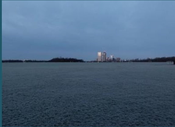
Wormwood Scrubs, West London